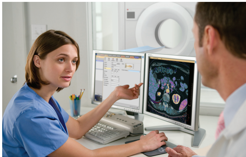
Results are ready to be read on the PACS.

Should the clinician decide that spectral information would be of additional value in a particular region of interest, the spectral information acquired during the single spectral scan can be easily accessed for retrospective, on-demand spectral data analysis.