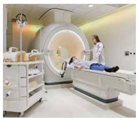
A spacious examination room in the Marienhospital