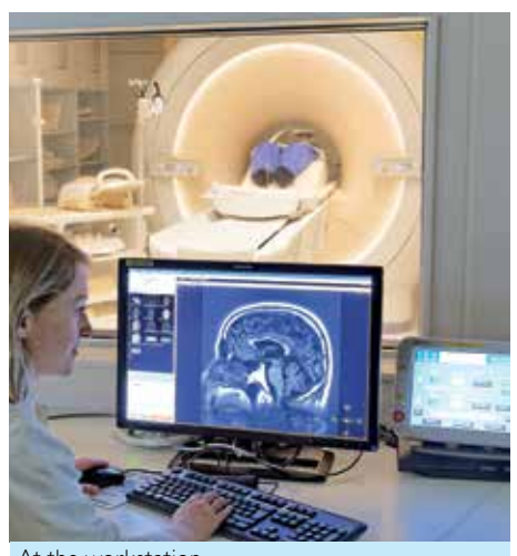
At the workstation