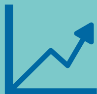
Enhanced patient experience

You benefit from easier budgeting, improved liquidity and peace of mind plus you can use your existing bank lines for other business. Moreover, ultimately it helps you on your journey towards achieving the all-important quadruple aim; enhanced patient experience, improved staff experience, and better health outcomes, with lower cost of care.