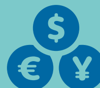
Lower cost of care