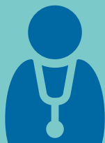
Improved staff experience